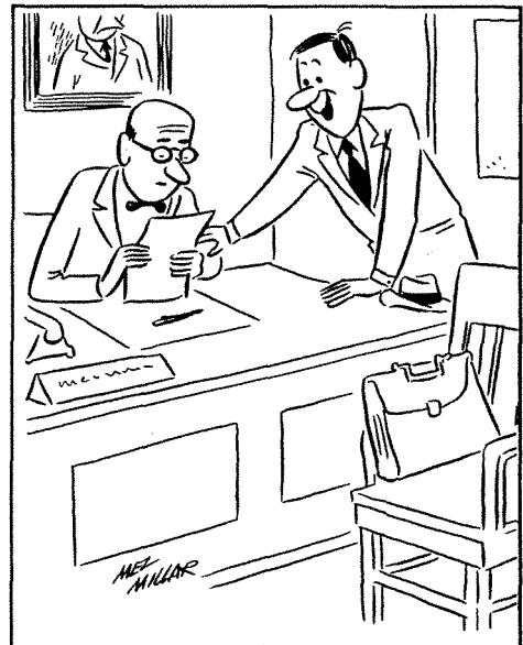
"Just sign the bottom line, sir, and I'll get out of your hair. . ."